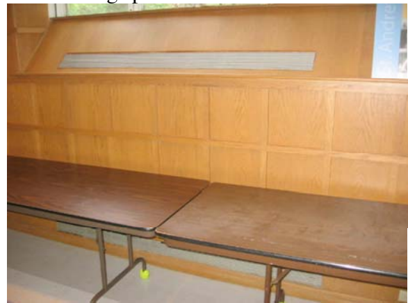
#10 — Convection radiation (here in Dining Room) ready changed to hot-water heat. Large rooms at each level of Parish House should each be a separate zone.