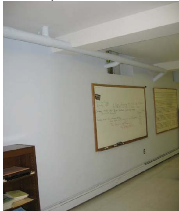
#4 — Choir room with hot-water baseboard heat. Pipes at ceiling serve steam radiation in Transept Chapel. Use high-efficiency radiation, including in-floor were possible.