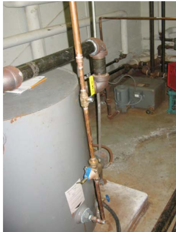
#3 — Condensate tank and pump for steam system. Steam is less efficient given need to heat to 212° regardless of temperature needed in occupied spaces. It is less readily zoned.