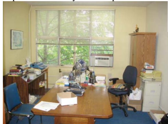
#9 — Office level is high use area, an early hot-water heat and zoning conversion candidate. Use more efficient AC solution for south-facing spaces.