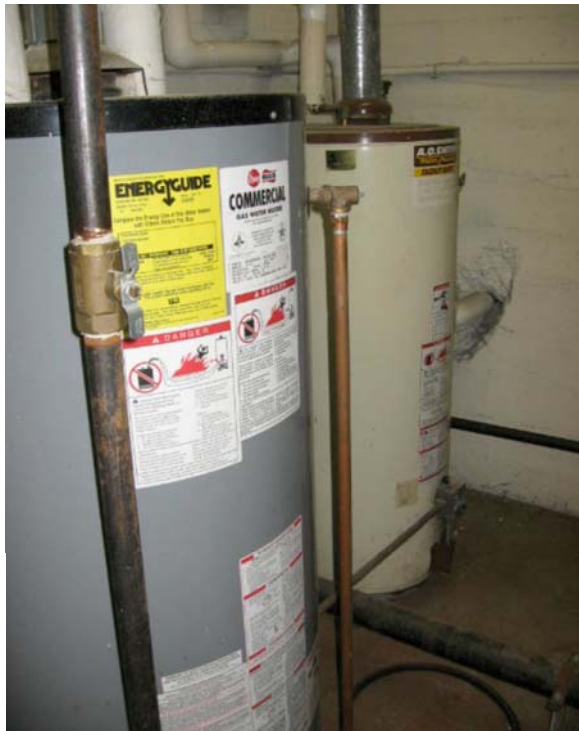
#2 — There are two gas-fired DHW tanks. Efficiency is 65%±. Replace with one indirect fired tank served by an efficient (93%) gas-fired boiler.