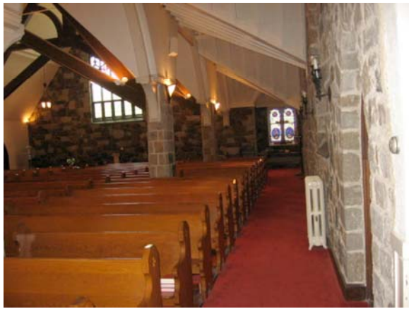
#5 — Sanctuary has steam radiators. Note manual thermostat on wall. Change all stats to “smart” programmable for immediate efficiency improvement.