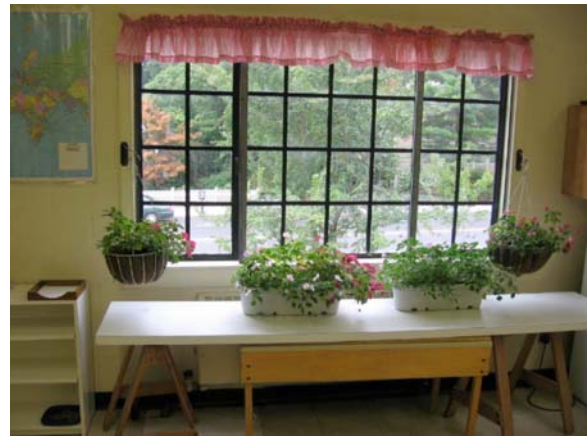
#8 — Window in upper floor room used by Montessori School. Convert spaces from steam to hot water heat, and increase zones, progressing from most to least used spaces. Install interior “storm” windows now for improved efficiency and occupant comfort.