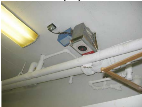
#6 — Steam zone valve. Age of steam system means interior pipe corrosion returns to boiler (a problem) and also contributes to sticky valves. All systems have an “Expected Useful Life” (EUL), which the steam system at St. Andrew’s nearing its end.