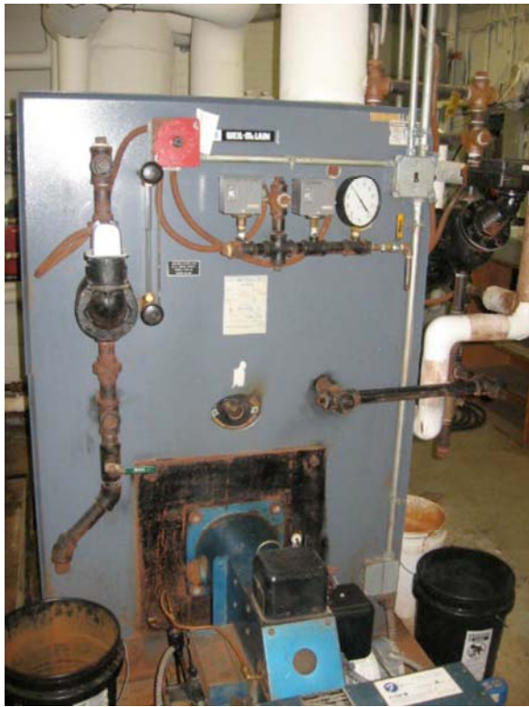
#1 — Oil-fired steam boiler was (efficiency 75%±) installed in 2000. It has an on-board heat exchanger to generate hot water heating for the choir room zone.