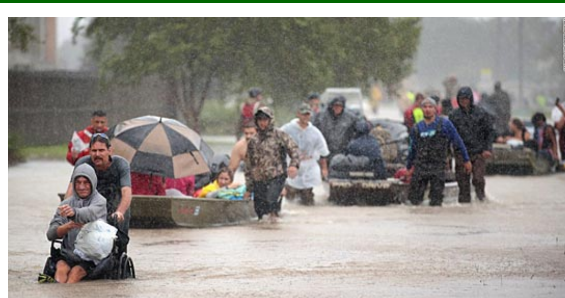
Leaving Houston during hurricane Harvey

Thursday, September 14 at 7 PM Aquarium's Simons IMAX® Theatre