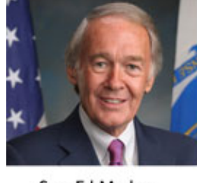
Sen. Ed Markey