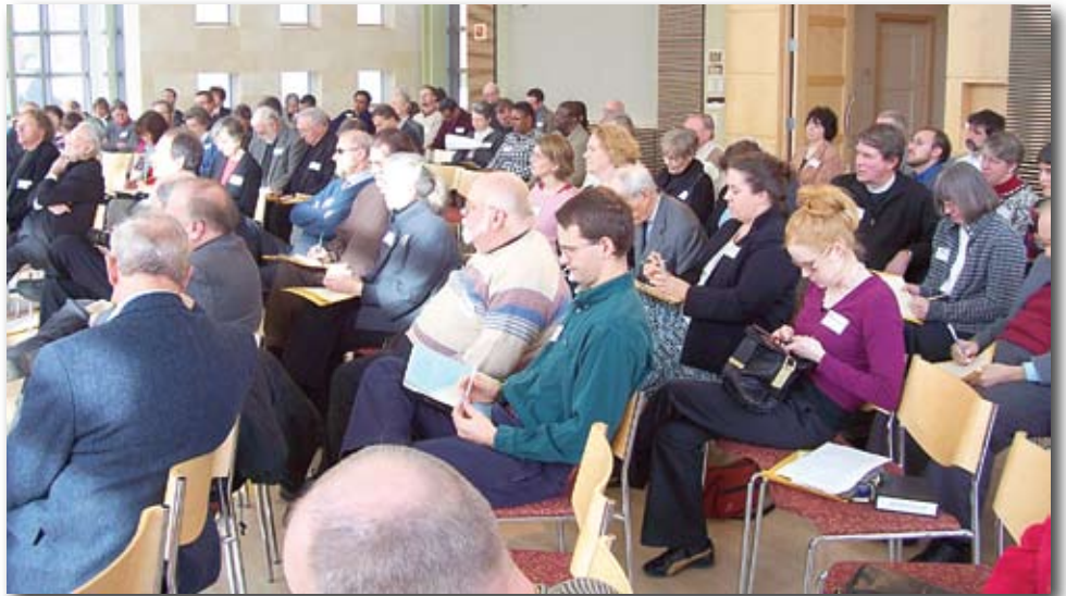
Over 150 delegates and guests gathered in Wilson Chapel at Andover Newton for the 2009 Annual Meeting whose theme "New Beginnings: Our faith witness in the Historic moment" engaged the audience in worship, dialogue and proactive presentations.