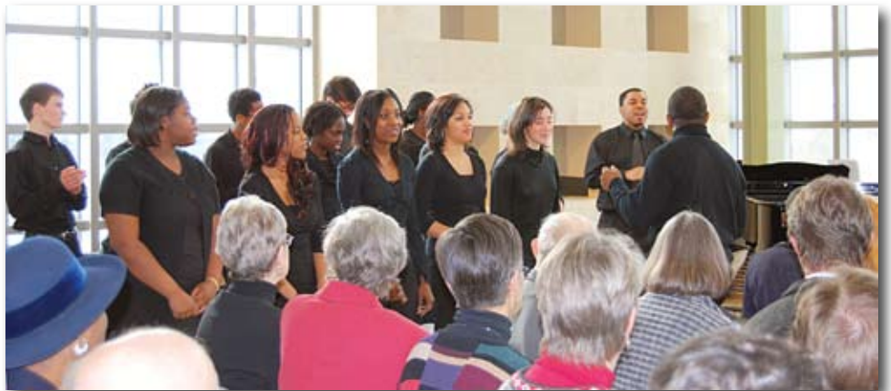
The Inner Strength Gospel Choir from Boston University lifted our spirits by their musical anthems during our prayer service of Christian Unity.