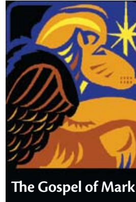
The Gospel of Mark