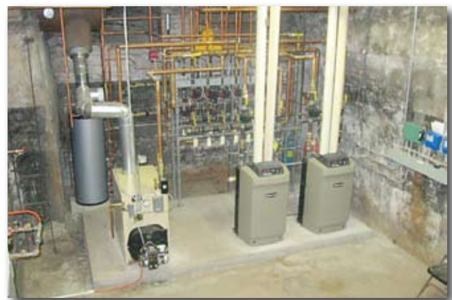
New Boilers at St. James Church.